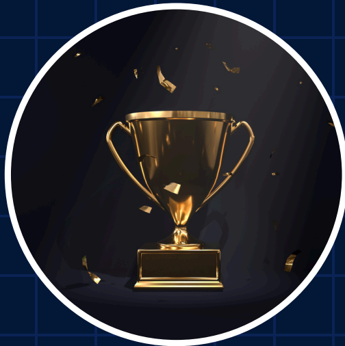
CONNER KROLLMAN Southwestern Community College